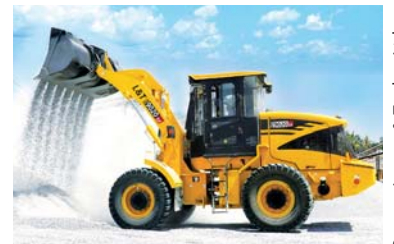
L&T 9020sx - designed and developed by in house R&D

Komatsu has showcased its entire range of construction segment machines at the exhibition, namely, Komatsu Hydraulic Excavators models PC71, PC130, PC210, PC300, PC450 and D85 Crawler Dozer. The highlight is the first-time display of Komatsu GD535 Motor Grader with world-class features such as Komtrax machine tracking system, and PC350 Hydraulic Excavator with reinforced structures. These machines carry the hallmark of cutting-edge Japanese technology and have been very well accepted in the Indian market. PC210 Super Long Front machine is also on display along with PC71 Tunnel and PC130 Quarry variants. L&T extends complete after-sales service solutions to the wide range of Komatsu excavators for various segments and applications. L&T has put up an impressive display of its entire range of road machinery such as L&T 1190 Soil Compactor, L&T 990 Tandem Compactor, L&T 491 Mini Compactor and L&T 9020sx Wheel Loader. L&T 2490 Pneumatic Tyred Handler, L&T S315R Skid Steer Loader and L&T 5590H Hydraulic Paver will be laun-