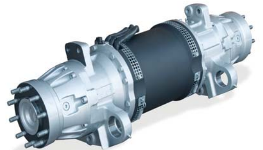
Bonfiglioli's 600F axle for electrically operated vehicles.

"Our business philosophy has been to partner with OEMs who are leaders in their business and develop highly customized power transmission solutions to cater to their requirements," he informs. This must be one of the many reasons for Bonfiglioli to be the largest producer of planetary drives for mobile equipment. The company has extended the same approach to the Indian market as well, with the target audience being major OEMs operating in India.