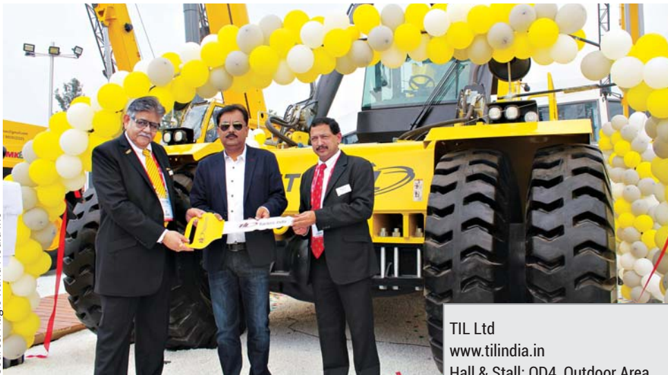
TIL Ltd www.tilindia.in Hall & Stall: OD4, Outdoor Area

O n the very first day of Excon 2017, three products were launched by TIL. MOBILOAD 315 in the Pick-n-Carry crane segment, RT 750 a new addition to the comprehensive range of rough terrain cranes and the new Hyster-TIL ReachStacker presented by Hyster-Yale Group Inc. and TIL which has been developed specifically to meet the demands of ports and other tough container handling applications in growing markets.