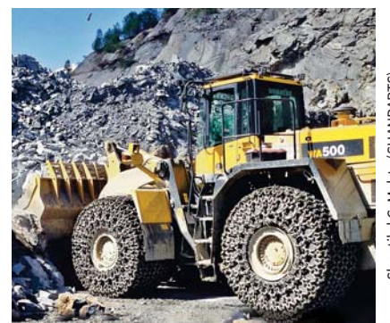
Tyre Protection Chains from Las-Zirh of Turkey

It seems to be an undersold product especially where the market for Tyres is so mature and developed. In most advanced countries, Las-Zirh Chains are very commonly