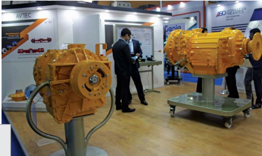
AVTEC Ltd www.avtec.in Hall: 1(Upper Level), Stall: G-199

A VTEC, one of the largest independent manufacturers of powertrain and precision engineered products, added one more feather to its cap by introducing its new product offering AH8700 at EXCON 2017. The AH8700 is a 1200 hp heavy duty transmissions ideal for 100T mining dump truck and oil field applications. Designed and developed at its in-house tech centre at Hosur, Tamil Nadu, the product has been validated in the harshest of Indian conditions and has unique features that ensure reduced cycle time with 7 forward speeds and 1 reverse speed, improved fuel efficiency with lock up clutch arrangement and better gradeability with optimum step ratio for effective torque utilization.