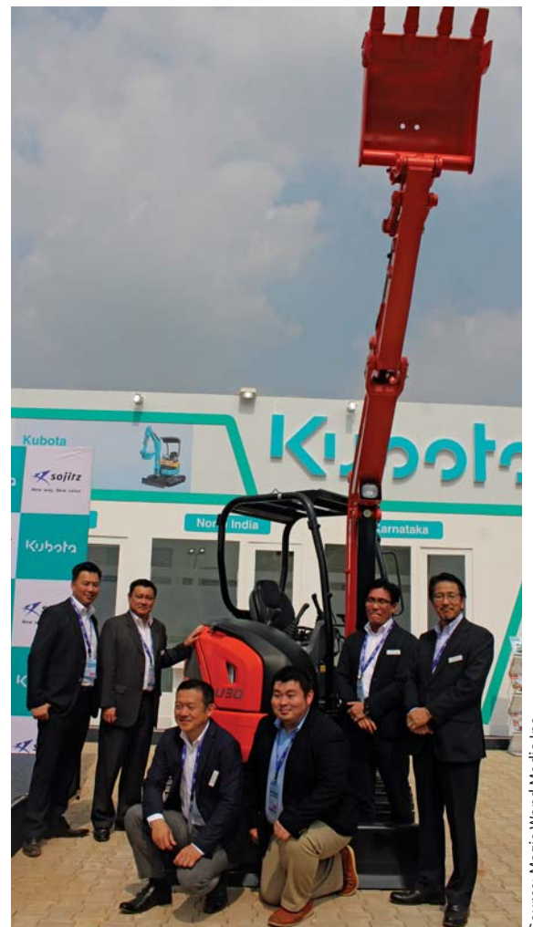
Kubota Corporation www.kubota-global.net Hall:3 (Lower Level), Stall: A - 53