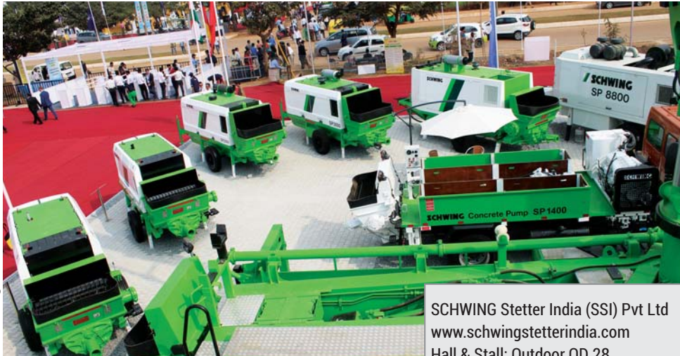
SCHWING Stetter India (SSI) Pvt Ltd www.schwingstetterindia.com Hall & Stall: Outdoor OD 28

S chwing Stetter India (SSI), the concrete equipment manufacturing company launched 18 new products at Excon 2017. The new products launched in 3200 sq mt space are Schwing Stationary Concrete Pump SP 1015; Schwing Stationary Concrete Pump SP 1330; Stetter Batching Plant M3 etc.